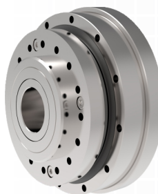
WSHG-III Series Reducer