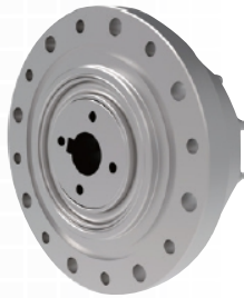
WCSG-I Series Reducer