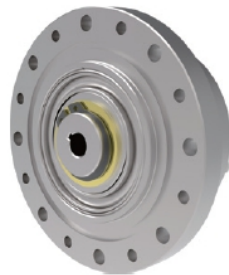
WCSG-II Series Reducer