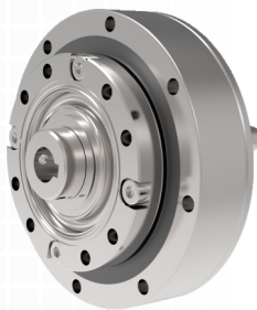
WSHG-II Series Reducer