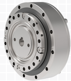
WSHG-I Series Reducer