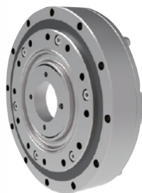
WSHD- I Series Reducer