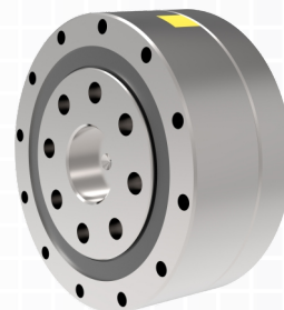
WCSD- I Series Reducer